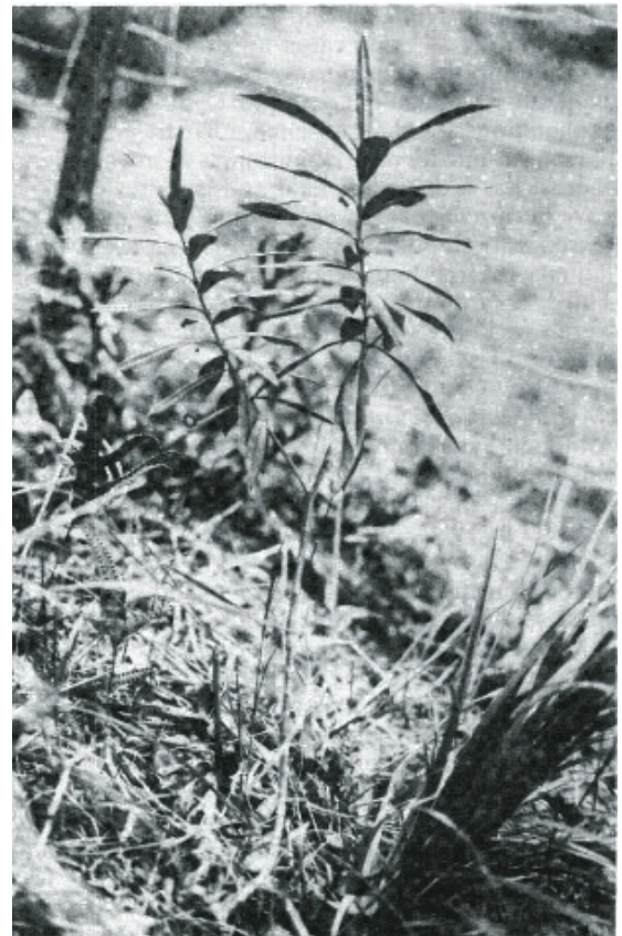
Figure 6: Hebe breviracemosa , Raoul Island, 1983.

Some other rare species - Pisonia umbellifera , Pittosporum crassifolium and Asplenium