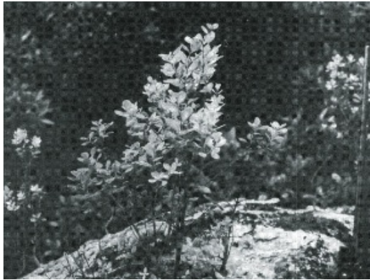
Figure 5: Epicormic shoots on old windthrown pohutukawa , crater rim, Raoul Island 1982.

claimed that goats could check the development of seedlings. In 1982, palms of all sizes were common, with impenetrable stands of young palms, usually without trunks in some areas (Fig. 3). Here, the palms were dense enough to suppress the usually ubiquitous introduced aroid lily ( Alocasia macrorrhiza ).