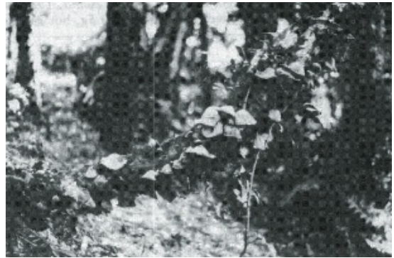
Figure 4: Auricularia sp. on mahoe, Raoul Island, 1983.

those rarely eaten because either the species are unpalatable and/or only ingested accidentally (e.g., Bidens pilosa which occurred only as seeds), or are rare (e.g. Boehmeria australis var. dealbata ), or are restricted to small areas on the island (e.g., Macropiper excelsum var. psittacorum ).