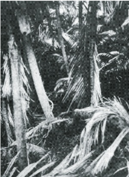
Figure 3: Dense standards of nikau palms, Raoul Island, 1982.

The minor food items ranged from those eaten by many goats but rarely in quantity (e.g., Coprosma spp. Phymatosorus diversifolius ) to