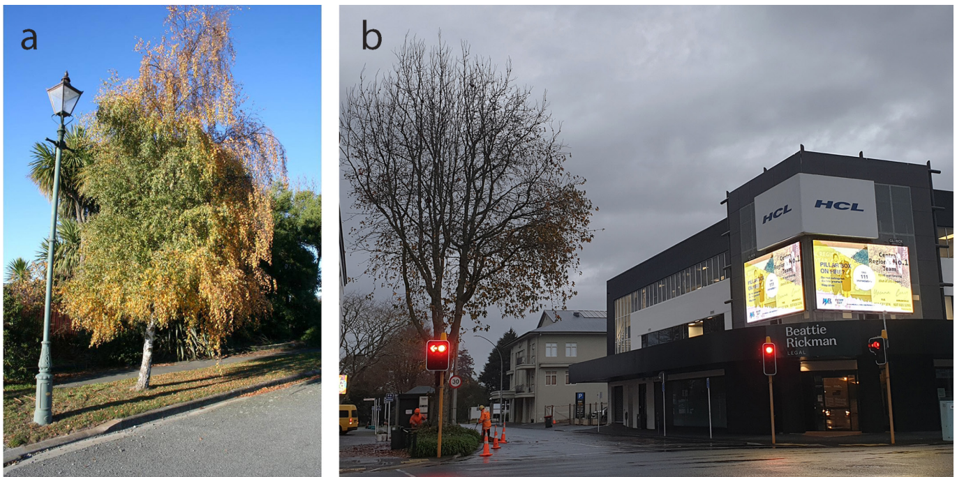
Figure 4. Light emitted at night can delay the onset of leaf senescence. (a) a birch ( Betula sp.) shows senescence only of leaves not directly adjacent to a streetlight in Darfield, Canterbury, and (b) light emitted from digital billboards within the Hamilton city centre delays senescence on the light-exposed side of a liquid amber tree ( Liquidambar styraciflua ).

2014; McNaughton et al. 2021). Species also responded differently depending on the colour temperature of white light. For example, Pawson and Bader (2014) did not detect a significant difference between the abundance of terrestrial invertebrates that were attracted to lights ranging between 2700 and 6500 K CCT, whereas forthcoming research found a difference in attraction between 2700 K and 6000 K for some aquatic invertebrate taxa (M. Greenwood, NIWA, pers. comm.; Schofield 2021).