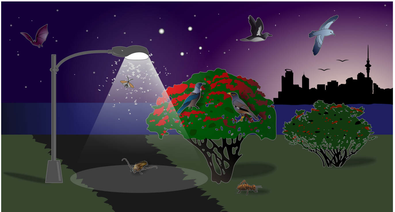
Figure 3. Artificial light at night (ALAN) from local sources (e.g. streetlights) or diffuse sources in the distance (skyglow) can impact the physiology, behaviour, phenology, and fitness of various taxonomic groups. Positively phototactic taxa are attracted to ALAN (including caddisflies, Trichoptera, and huhu beetles Prionoplus reticularis ), while negatively phototactic taxa avoid ALAN (such as cave wētā, Raphidophoridae, male Auckland tree wētā Hemideina thoracica , and long-tailed bats Chalinolobus tuberculatus ). ALAN can also obscure natural nocturnal light sources used in navigation and disorientate seabirds and cause fall-out (e.g. fairy prions Pachyptila turtur , and Hutton's shearwaters Puffinus huttoni ). ALAN can alter circadian or seasonal patterns. For example, Metrosideros excelsa , pōhutukawa trees near streetlights have been observed to flower more profusely than those further away from lights. Characteristics of the light perceived by taxa (e.g. intensity and colour composition) may affect the circadian responses. For example, changing high-pressure sodium streetlighting to LED fixtures coincided with indigenous tūī ( Prosthemadera novaeseelandiae ) and exotic common myna ( Acridotheres tristis ) starting their dawn chorus later in the morning. The extent to which these changes affect species interactions (e.g. between predators and prey, plants and their pollinators, parasites and their hosts) has not yet been studied in Aotearoa New Zealand. Textures modified from Creative Commons Attribution 2.0 Generic licensed images.

number of publications that directly studied the impacts of nocturnal lighting, emphasising that ALAN is an understudied pollutant in Aotearoa New Zealand. Based on global studies, we expect that there is potential for other ecological impacts of ALAN on native flora and fauna beyond those presented here.